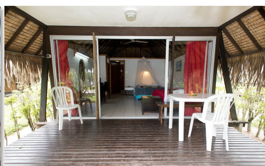
Hotel Hibiscus (Garden Bungalow)