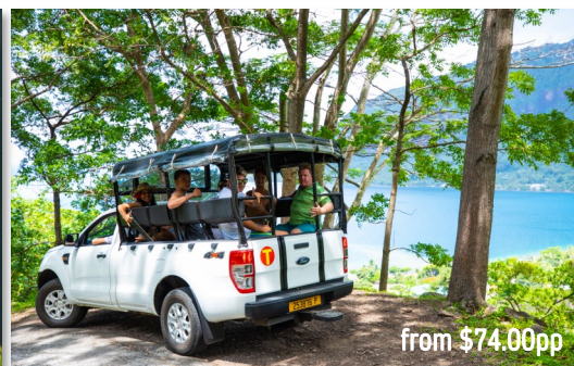
Aito 4x4 Safari Tour