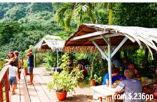
Moorea Food Adventure

We can book a range of tours and activities on Moorea including those shown below. Feel free enquire with us on the tours you would like to do.