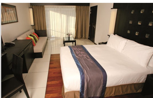
Hotel Tahiti Nui (Standard Room)