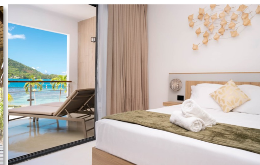
Cooks Bay Resort (1 Bedroom Suite)