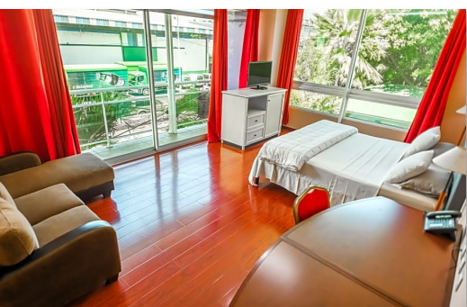
Hotel Sarah Nui (Premium Room King)