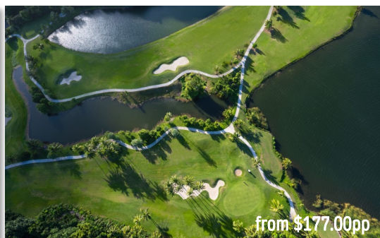
Moorea Green Pearl—Swing Pass (9 Holes)