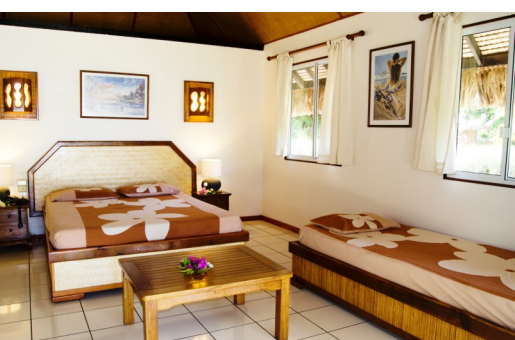
Les Tipaniers Hotel (Standard Bungalow)