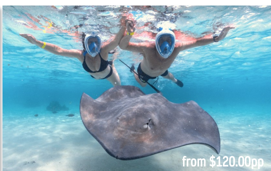
Authentic Moana Lagoon Excursion