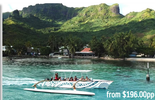
Outrigger Miti Lagoon Tour, Moorea